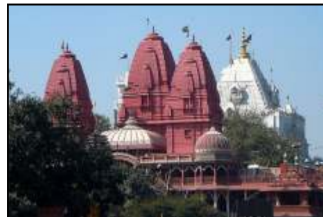
6. Digambar Jain Lal Temple