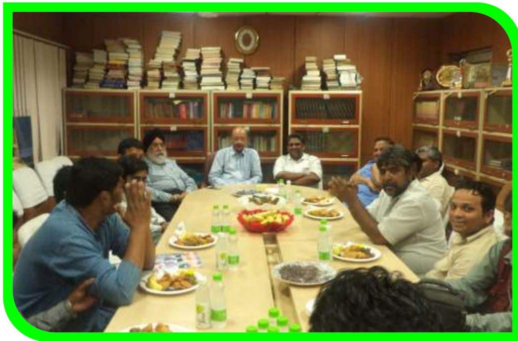
Media & Roza Aftar by Delhi Minority Commission

Press note covering all important events & programmes organized by the Commission or on its behalf are issued to media for wide coverage. During this period, 06 press releases were issued.