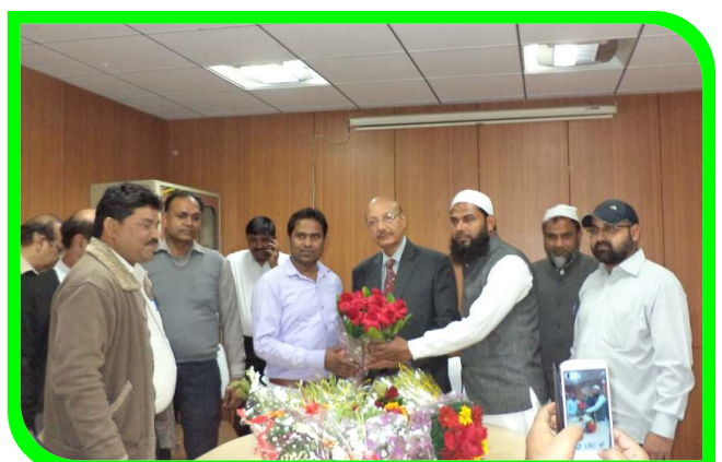
Muslim Advisory Committee Meeting