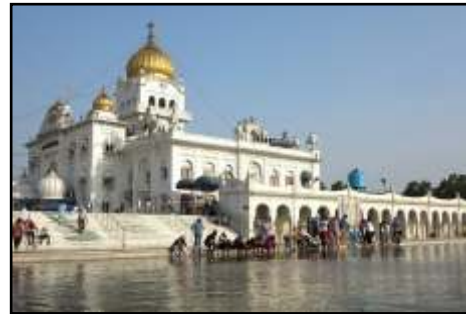
2. Bangla Sahib Gurudwara