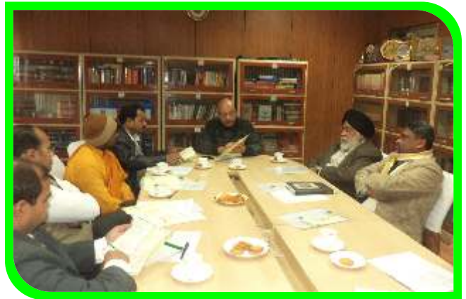
Buddhist Advisory Committee Meeting