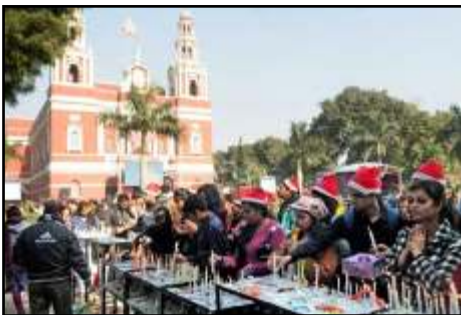
3. Sacred Heart Cathedral Church