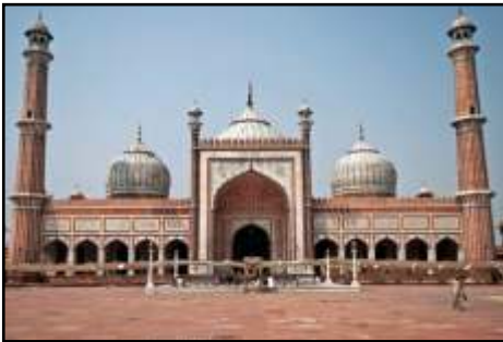
1. Jama Masjid