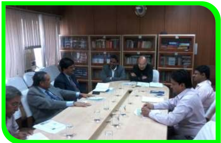
Jain Advisory Committee Meeting

The Commission constituted advisory committee for each Minority Community i.e. separately for Jains, Muslims, Sikhs, Parsis, Buddhists and Christians. Separately, regular Meeting are held and ways are discussed for promoting communal harmony and other difficulties faced by the communities. They are fair representatives from various walks of fields/ professions/ associates of each community. The welfare committees shall act as advisory committees.