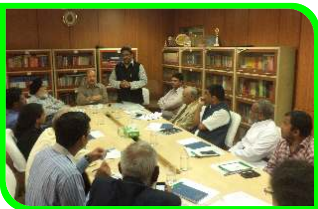
Christian Advisory Committee Meeting