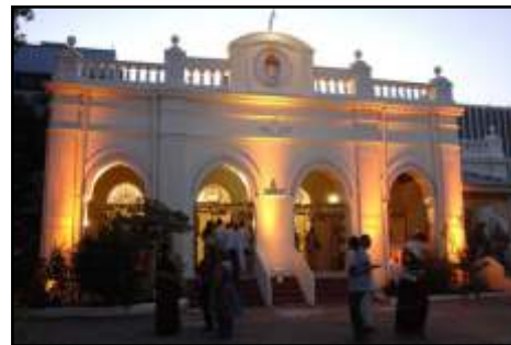
4. Parsi Fire Temple