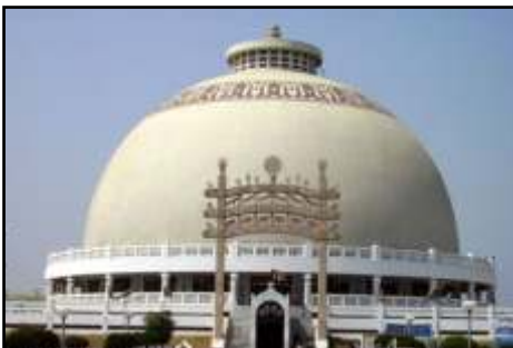
5. Buddhist Temple