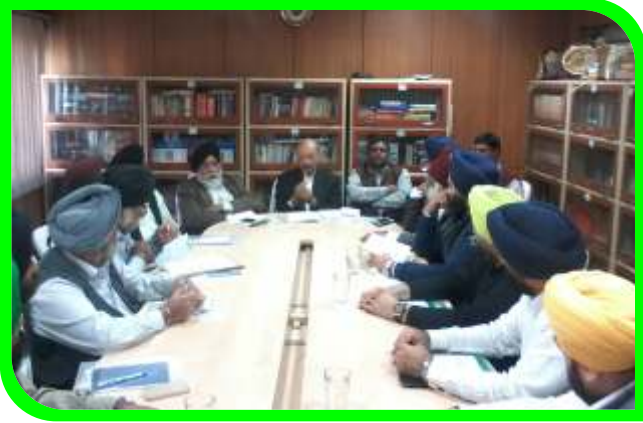
Sikh Advisory Committee Meeting