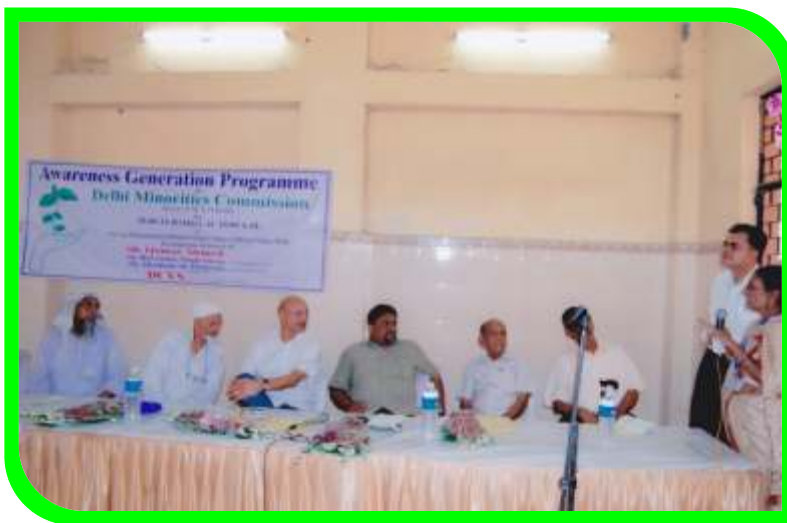
The Delhi Minorities Commission organized the 1 st awareness programme at Navyug Dharmshala, Vishwas Nagar, Delhi.

The efforts of the NGOs were appreciated by all.