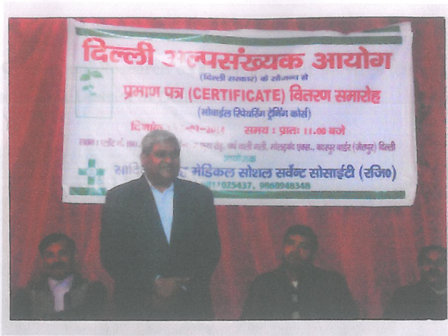
Delhi Brotherhood Society in Dilshad Garden of North East District of Delhi,