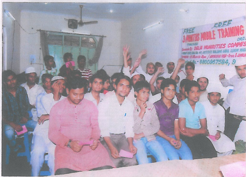
(ORDS Mobile training programme at Jafrabad)

and Operational Research and Development Services (ORDS) in Jafrabad of North East District of Delhi,