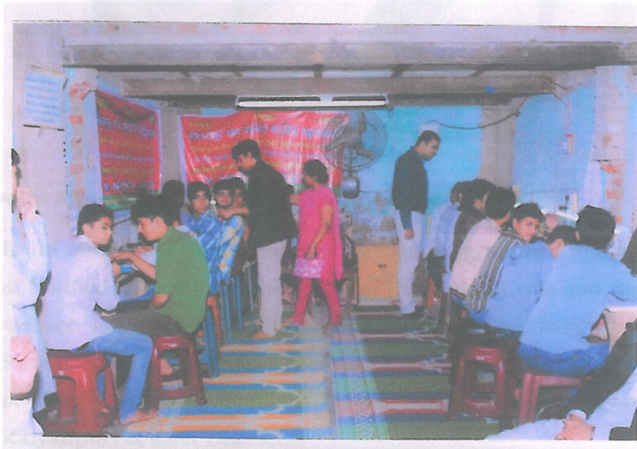
(ORDS Mobile training programme at Jafrabad)