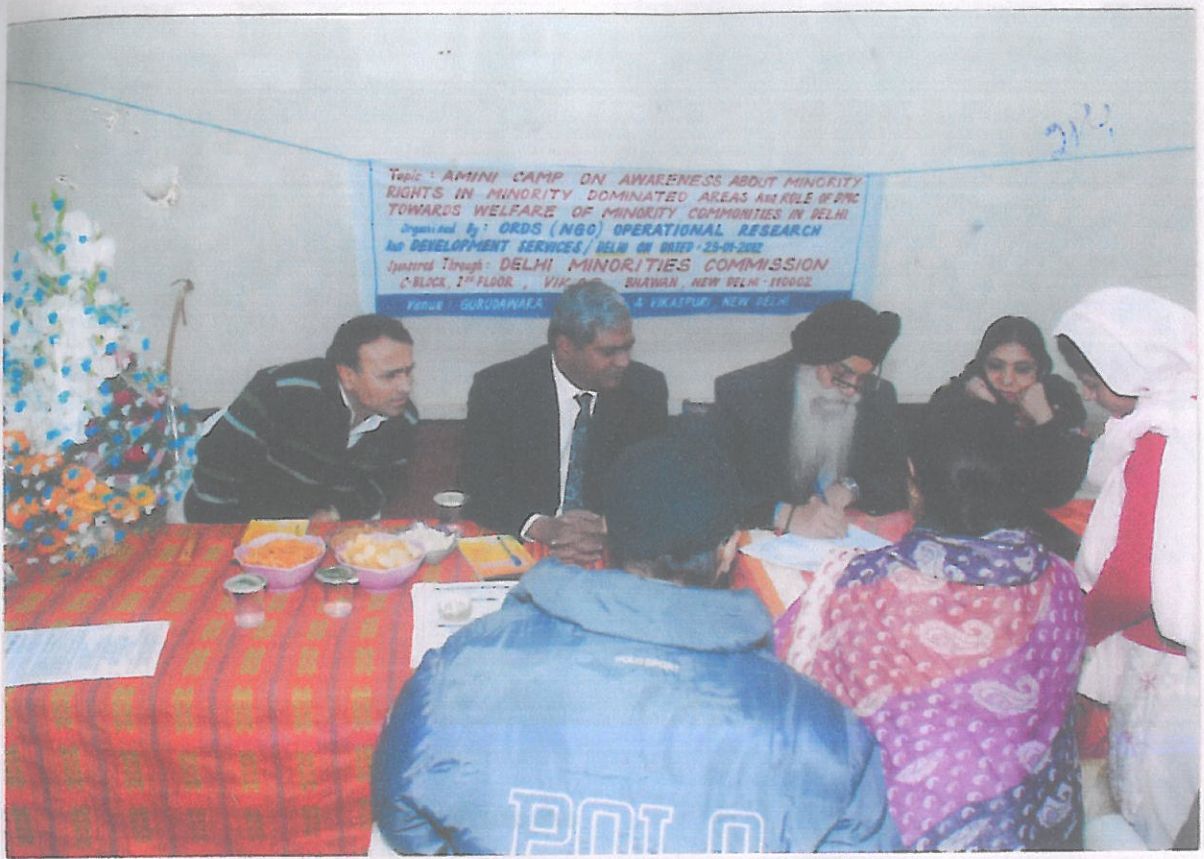
3.1 C The DMC had also organized mini awareness camps at Okhla and Sangam Vihar of South East district through its empanelled NGOs on dated 04.02.212 and 05.02.2012 respectively.