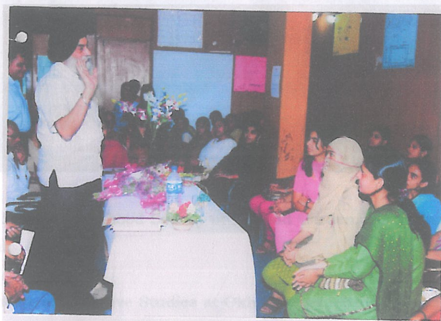
DCVS training programme at Laxmi Nagar

3.1 Commission has provided Job Oriented Computer Training Programme for Minorities Students /youth of Minorities dominated areas in Delhi through DCVS at Laxmi Nagar, East District,