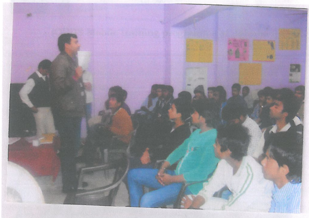
Ganga Devi Shaikshik Society in Nangloi of North West District of Delhi