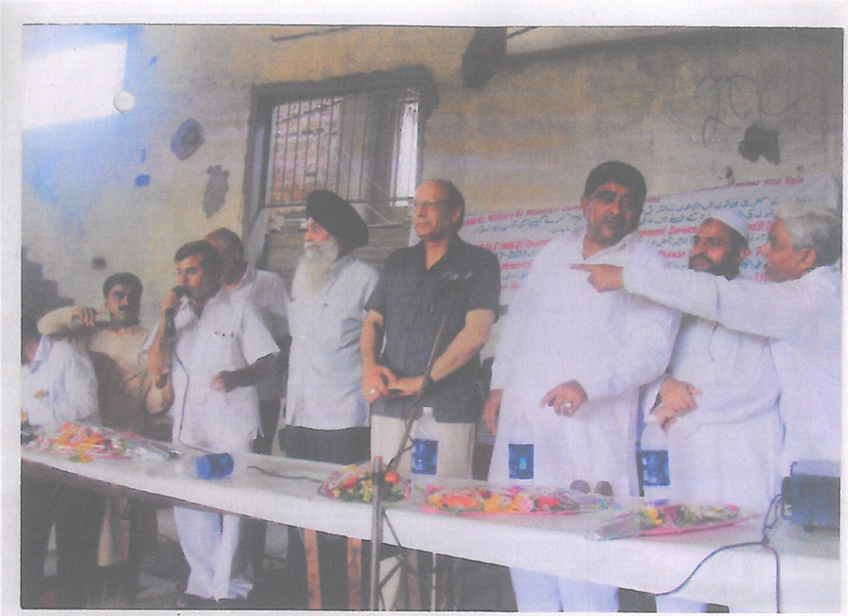
(Mustafabad Awareness Camp on 31.7.2011)

on 30.07.2011 and 31.07.2011 at Jafrabad and Mustafabad respectively in North East District, NCT of Delhi. The Commission had organized two other mini awareness camps through empanelled NGO of Operational Research and Development Services at Vikaspuri and Tilak Nagar in West Delhi on dated 28.01.2012 and 31.01.2012 respectively.