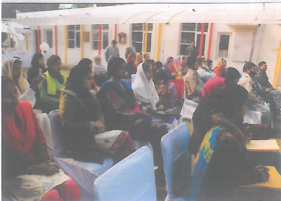
and Delhi Brotherhood Society at Dilshad Garden, North East District of Delhi.

Institute of Objective Studies at Okhla, empanelled NGOs. Through this activity numbers of minority communities' students have benefitted.