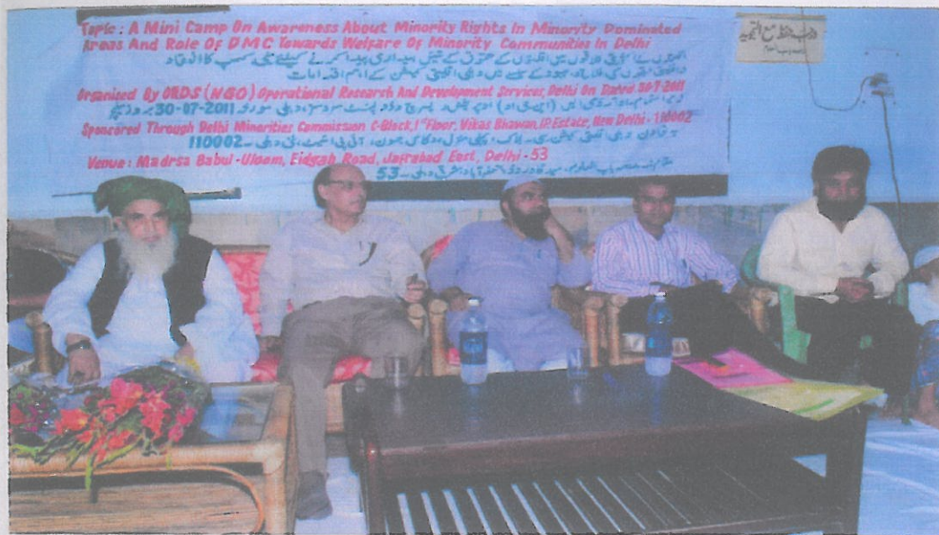
Mini awareness camp, Jafrabad, 30.7.2011 of North East district.