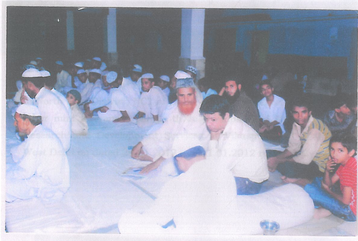
See above (30.7.2011 at Jafrabad, North East district)